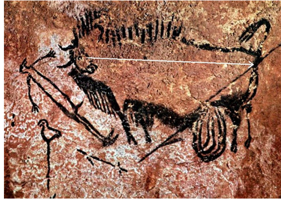
Hunting Scene (unknown artist), Lascaux Cave (France). Cave painting, circa 17,000-15,000 B.C.

Mesopotamia, or America. After the death of the animal, the process of its (in)corporation begins, through its flesh and the skin that covers its body. We also know Freud's myth about the primal horde and the totem feast: it is thanks to the incorporation of the meat of the dead totem animal that its qualities are acquired; in other words, it is thanks to the identification with the symbol which kills the thing that its significant and imaginary properties are introjected.