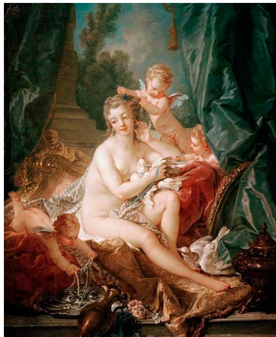
François Boucher, La toilette de Venus (1751), Metropolitan Museum of Art, New York.