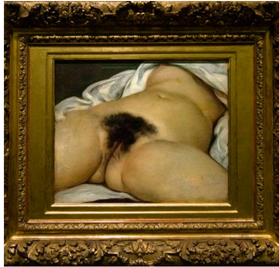
The Origin of the World (1866), Gustave Courbet, Musée d'Orsay, Paris, France.

It is remarkable that with the passage from the representation of the male body as a canon of beauty to that of the female body, Courbet's blunt questioning of the idea of canon produced a work showing, in the foreground, what had remained outside the gaze in the "beautiful female body": the vagina.