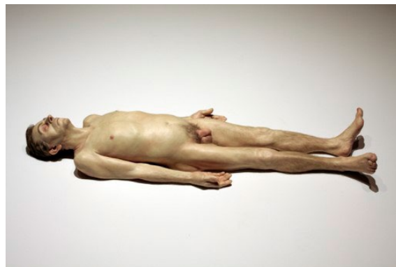
Ron Mueck, Dead Dad, 1996.

The figure we have chosen to present here is “Dead Dad” (1996). It is a sculpture which uses the body of his own father as a model. He even used the original hair for the figure. This work is paradigmatic of Mueck's work. In addition to the obvious connection which can be made with the great philosophical and psychoanalytic theme of the dead Father, there are other reasons: one of them is that he used the image of his dead father to make the sculpture. The reuse of human corpse fragments is a unique feature of our times, made possible by science and the mandate to recycle. In addition, this is another one of his works which focuses on a body that is old and shaped by time and life. But this time it has been struck by death. His sculptures are known to have been branded as looking alive; this one only needs to be actually dead. “Dead Dad” does not represent the death of Christ or that of some saint or monarch, like so many horizontal sculptures that can be found in many temples. It is not about the death of God; there is no transcendence in this death; it is that of an ordinary citizen. Is death the impossible challenge for science?