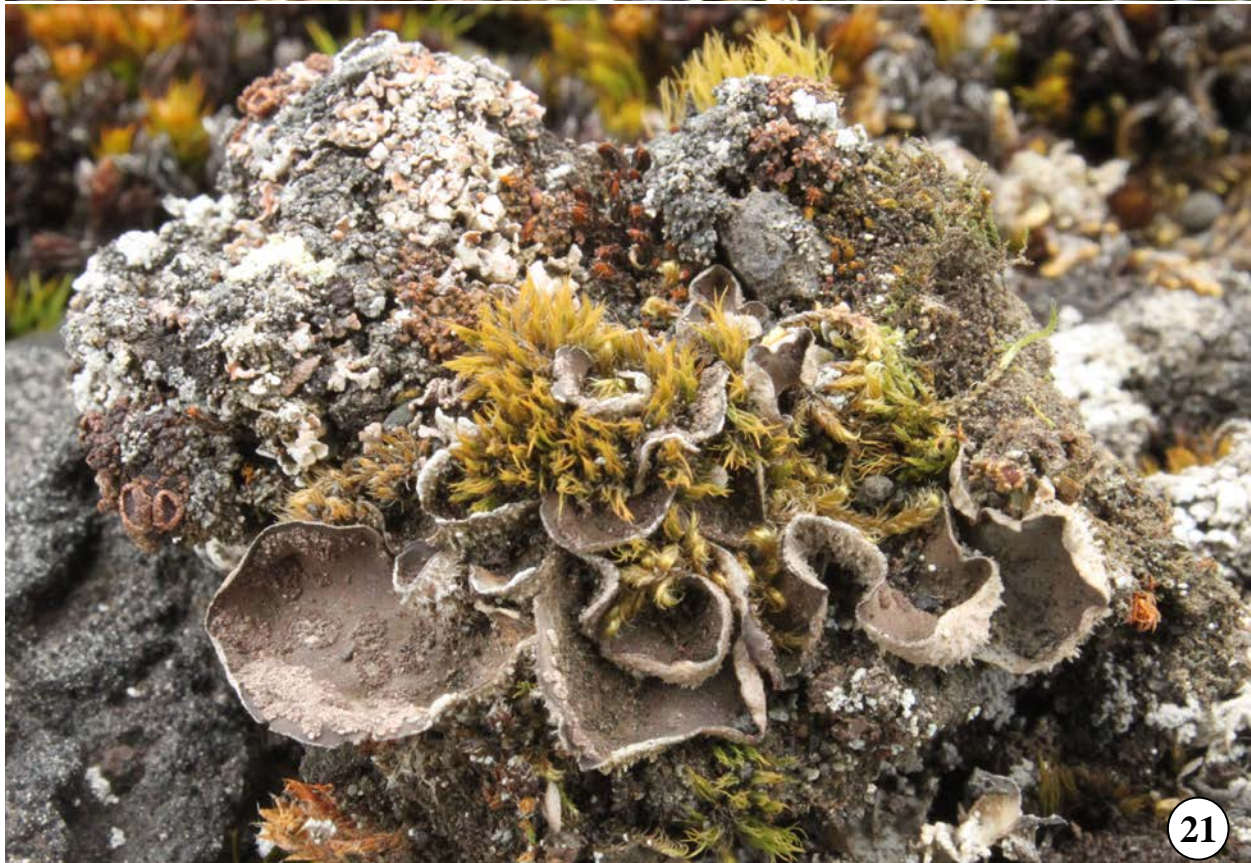
Figures 20-21: 20 – Parmelia saxatilis , foliose thallus growing over rock, mosses and Deschampsia (Hennequin Point, King George Island); 21 – Peltigera didactyla , a typically muscicolous, sorediate lichen (Deception Island).