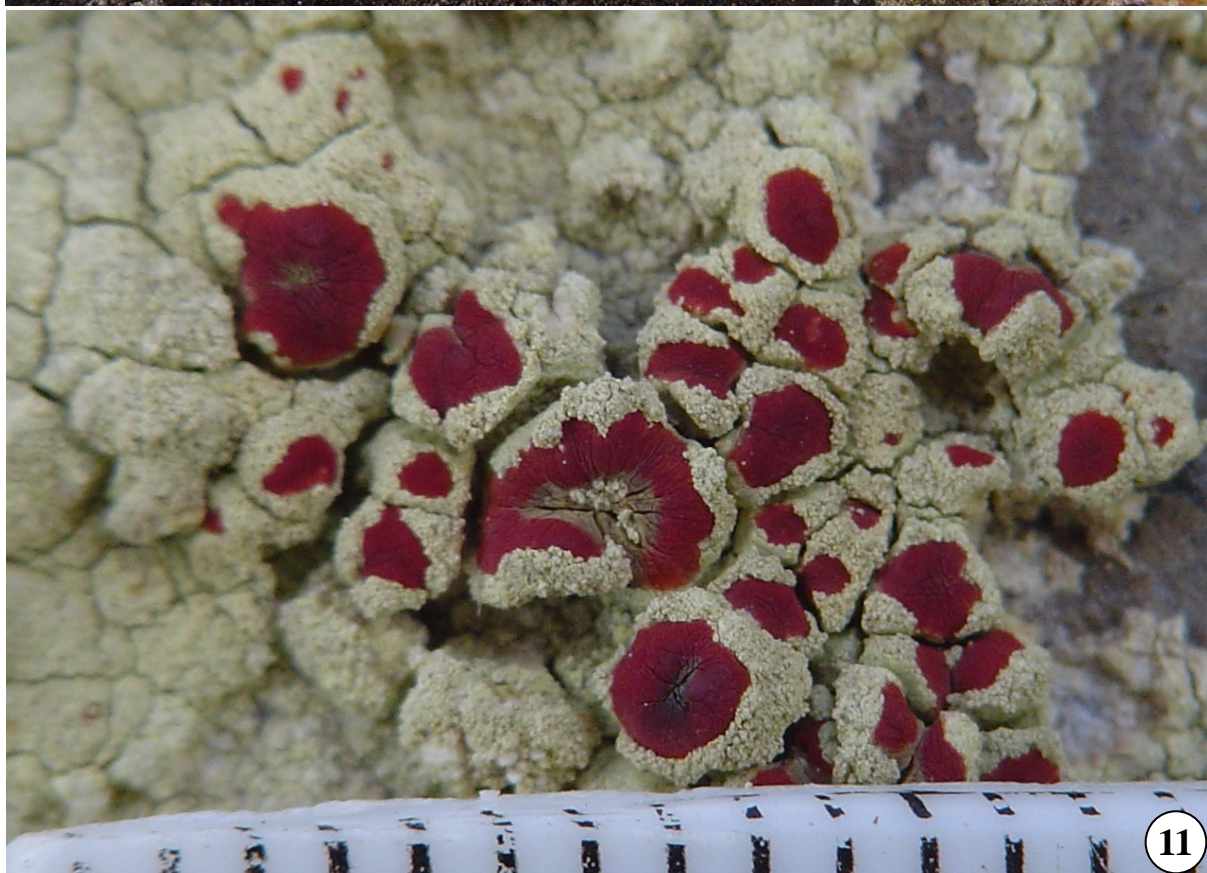
Figures 10-11: 10 – A rock covered by yellow Haematomma erythromma , together with Usnea and other crusts (Byers Peninsula, Livingston Island); 11 – Detail of the red apothecia of H. erythromma , note the scale in millimeters (Hennequin Point, King George Island).