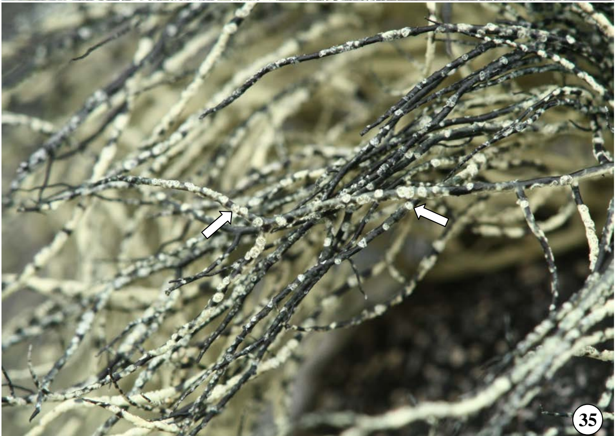
Figures 34-35: 34 – Usnea antarctica , showing the black pigmentation on the tips of branches (Hennequin Point, King George Island); 35 – Usnea antarctica , the arrows indicating the soralia (Hope Bay, Antarctic Peninsula).