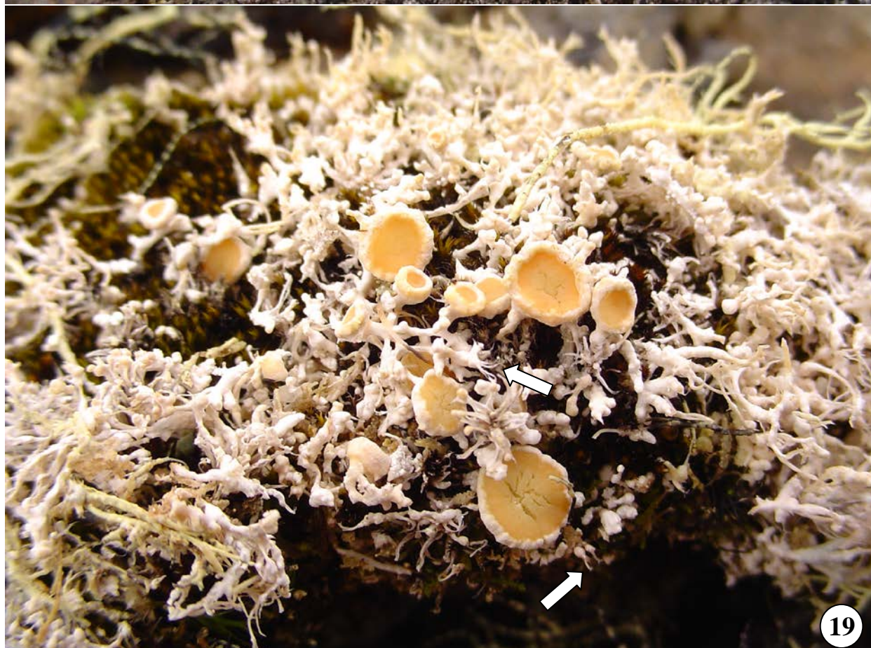
Figures 18-19: 18 – Ochrolechia parella , with its crustose thallus growing over rock (Byers Peninsula, Livingston Island); 19 – Ochrolechia frigida , over mosses, and showing apothecia and typical spines, indicated by the arrows (Byers Peninsula, Livingston Island).