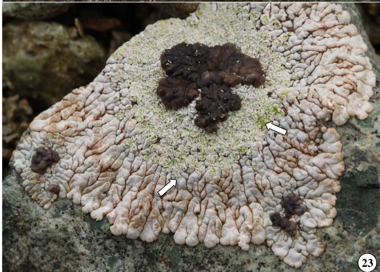
Figures 22-23: 22 – Physcia caesia , a foliose lichen with Trebouxia as photobiont (Keller Peninsula, King George Island); 23 – Placopsis antarctica , the central brownish part of the thallus is the cephalodium, while the arrows indicate the open pustules (Byers Peninsula, Livingston Island).