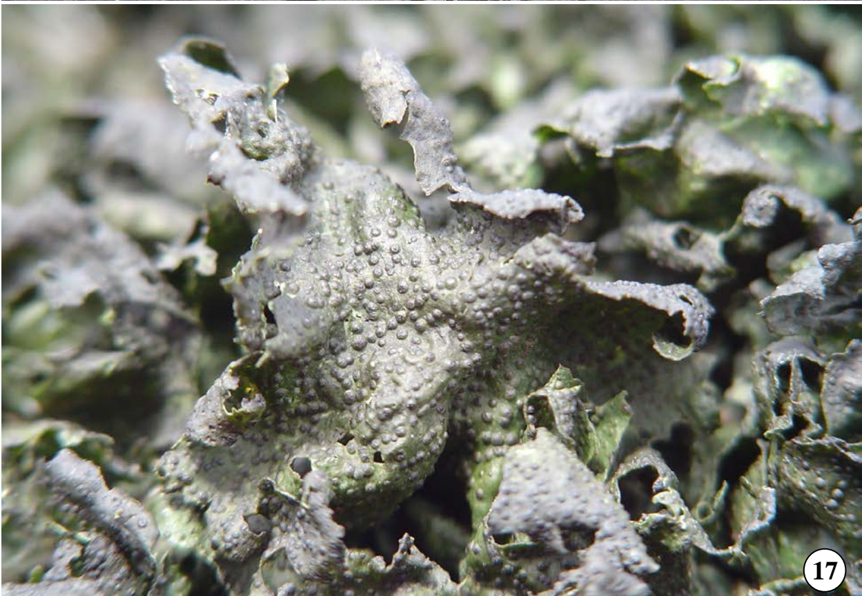
Figures 16-17: 16 – Mastodia tessellata showing the strong preference by guano (Stenhouse Point, King George Island); 17 – Details of the perithecia (black dots) of M. tessellata (Hennequin Point, King George Island).