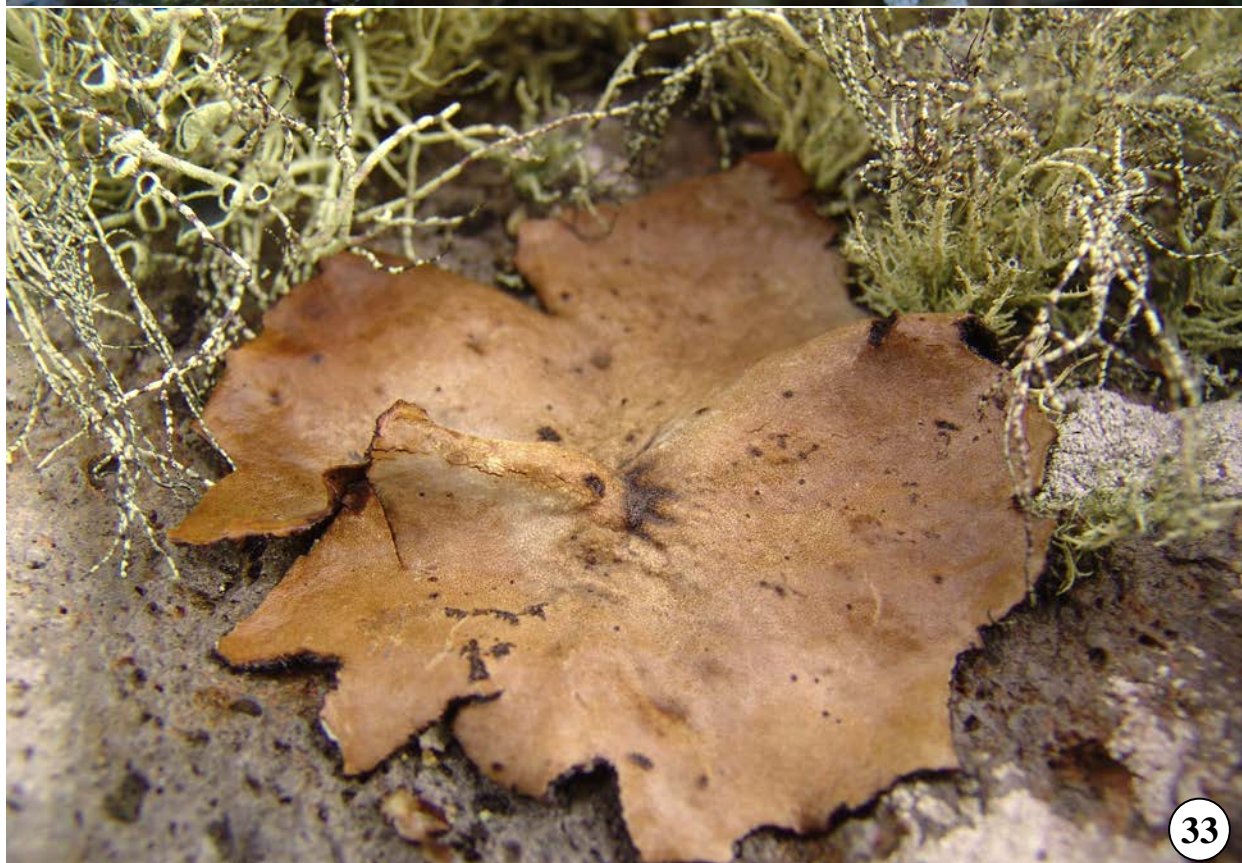
Figures 32-33: 32 – Stereocaulon alpinum , note the pseudopodetia covered by phyllocladia (Hennequin Point, King George Island); 33 – Umbilicaria antarctica , an Antarctic endemic foliose, umbilicate lichen (Potter Peninsula, King George Island).