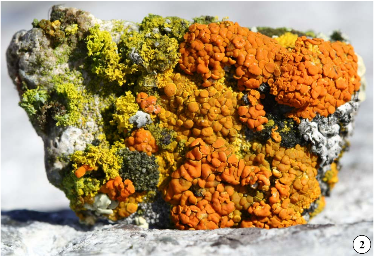
Figures 1-2: 1 – Acarospora macrocyclos , with brown thallus and lecanorine apothecia, growing over rock (Hope Bay, Antarctic Peninsula); 2 – A tiny pebble covered with Caloplaca (orange crusts) and Candelaria (yellow foliose thalli) (Hope Bay, Antarctic Peninsula).