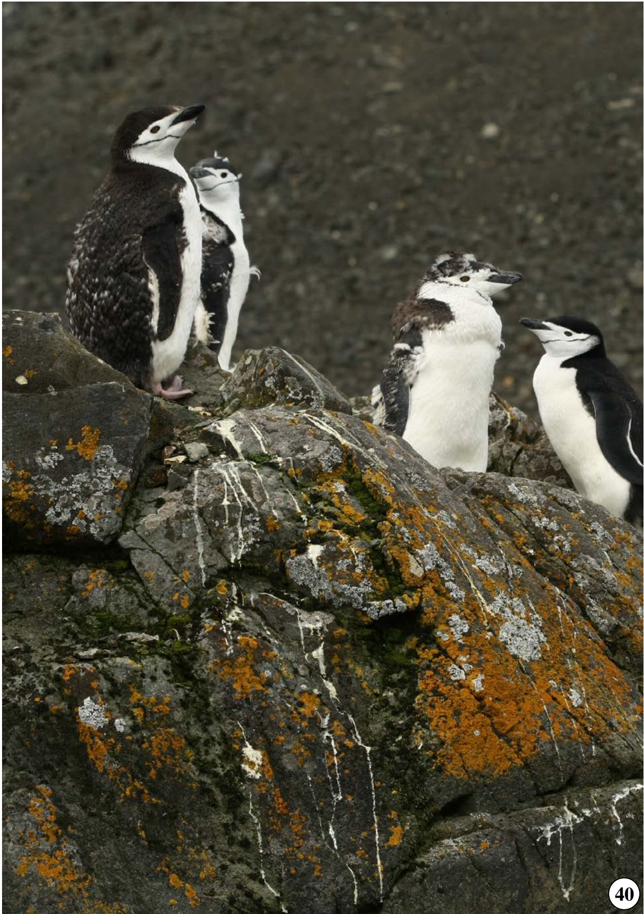
Figure 40 – A special acknowledgment to these nitrogen providers, very appreciated by many Antarctic lichen communities (Keller Peninsula, King George Island).