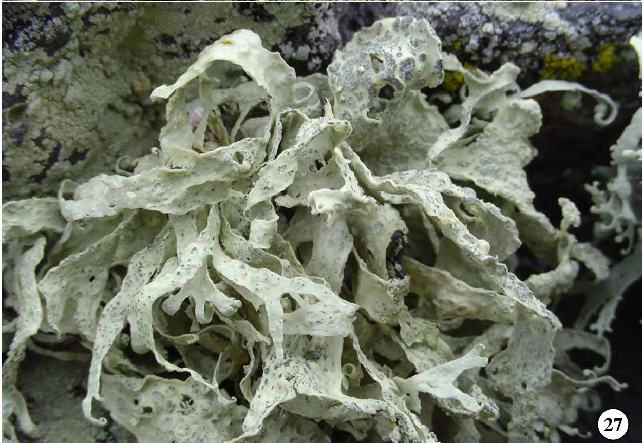
Figures 26-27: 26 – Ramalina terebrata , fruticose yellowish lichen usually associated with bird colonies (King George Island); 27 – Ramalina terebrata , showing the ulcerated, dorsiventral branches (Hennequin Point, King George Island).