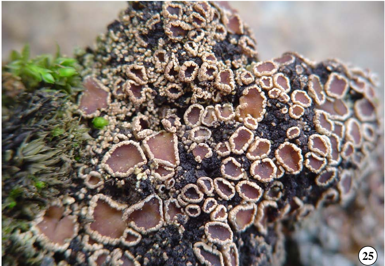
Figures 24-25: 24 – Pseudophebe pubescens , growing over rock (Potter Peninsula, King George Island); 25 – Psoroma cinnamomeum , note the brownish, lecanorine apothecia (Hennequin Point, King George Island).