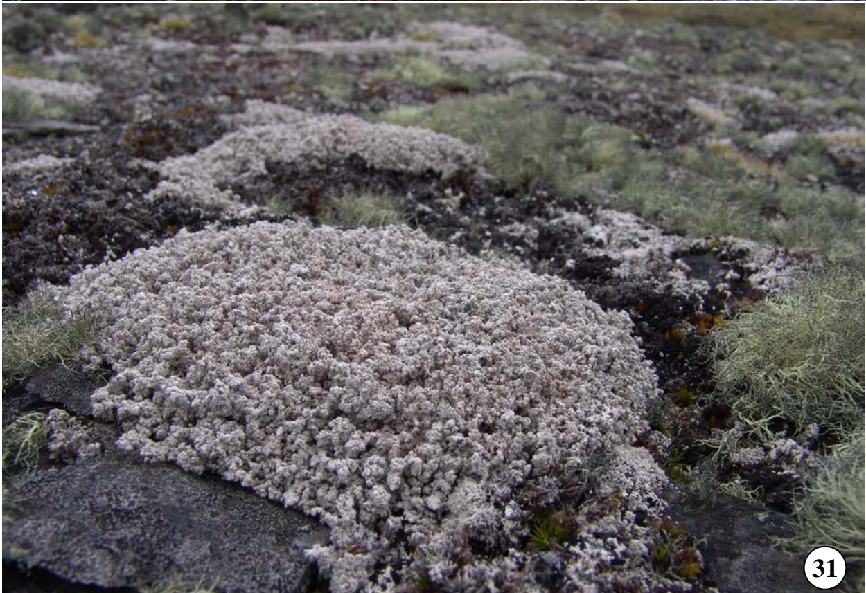
Figures 30-31: 30 – Sphaerophorus globosus , strongly branched (Hennequin Point, King George Island); 31 – Stereocaulon sp., in cushion-like formations (King George Island).