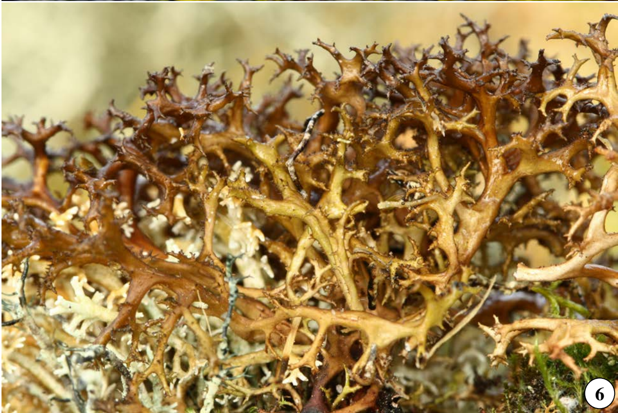
Figures 5-6: 5 – Candelaria murrayi , a yellow foliose lichen (Hope Bay, Antarctic Peninsula); 6 – Cetraria aculeata , note the small spines indicated by the arrows (Keller Peninsula, King George Island).