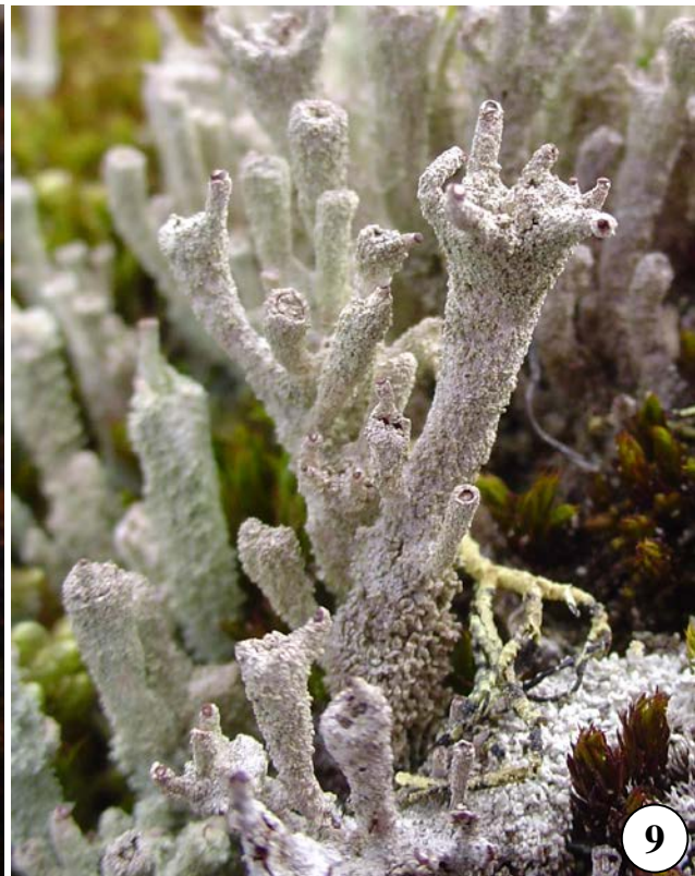
Figures 7-9: 7 – A small “forest” of Cladonia borealis , showing the podetia with broad scyphi, and Usnea antarctica . Use the water drop as scale (Keller Peninsula, King George Island); 8-9 – Cladonia spp., with distinct podetia types (King George Island).