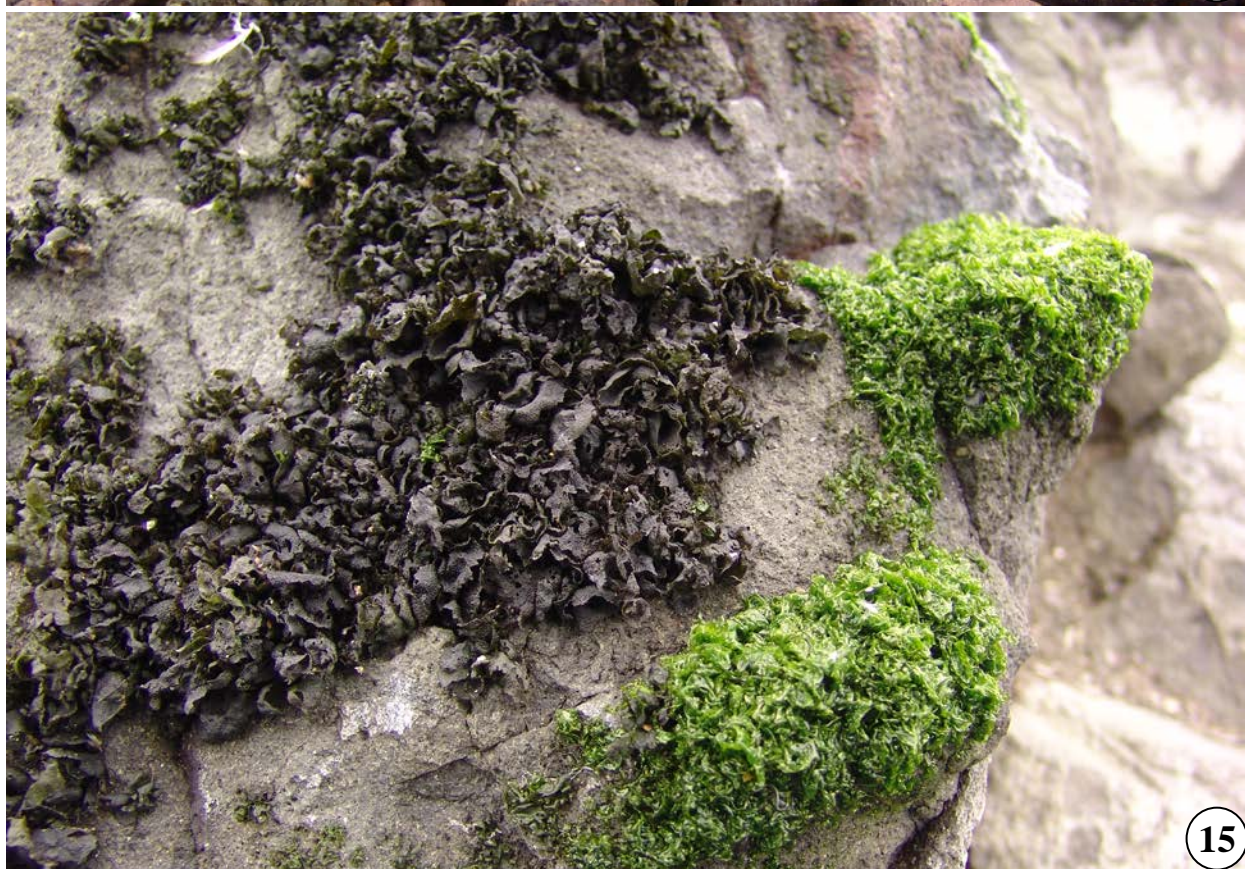
Figures 14-15: 14 – Leptogium menziesii , a gelatinous, foliose lichen with cyanobacteria ( Nostoc ) as photobiont (Potter Peninsula, King George Island); 15 – Mastodia tessellata (blackish) growing with Prasiola crispa (green algae) not yet lichenized (Potter Peninsula, King George Island).