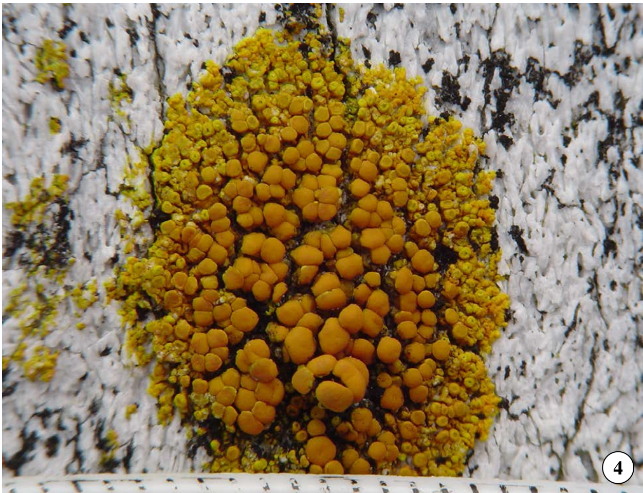
Figures 3-4: 3 – Caloplaca regalis , a fruticose member of this genus (Deception Island); 4 – Caloplaca sp., over a whale bone (Hennequin Point, King George Island). The scale is in millimeters.