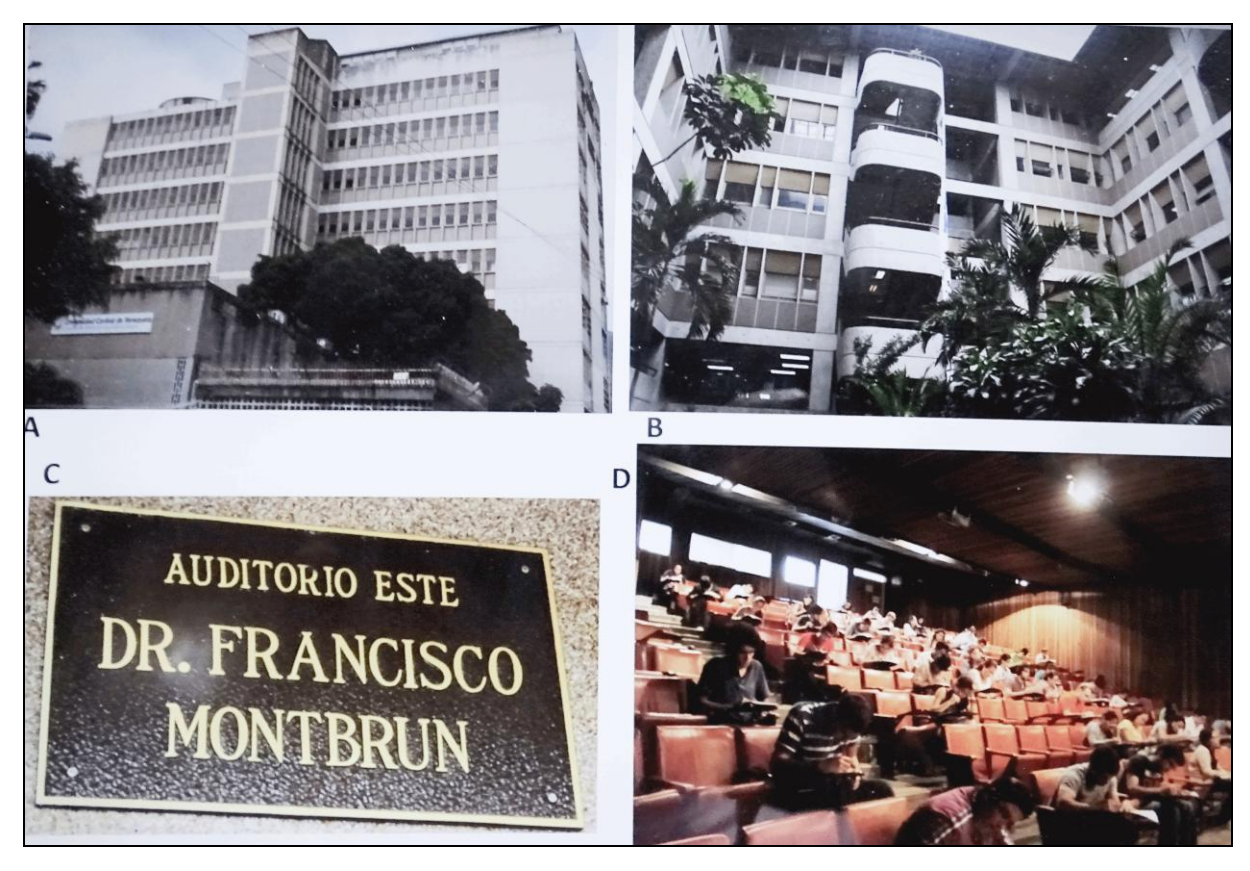
Figure 3- Montbrun's acknowledgments.

In the light of his long and meritorious career, Dr. Francisco Montbrun was elected National Corresponding Member of the Venezuelan National Academy of Medicine in 1987 and promoted to Individual of Number in June 1995. Montbrun published 74 scientific papers, 27 anatomy syllabi, 5 anatomy books, 2 books on public health policy: "A Strategy for a Health System" and "Venezuela, a View of Health, 1984-1988", and 37 other publications.