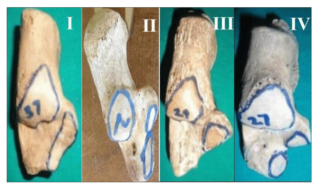
Figure 2.- Showing Patterns I, II, II, IV on the right calcaneus