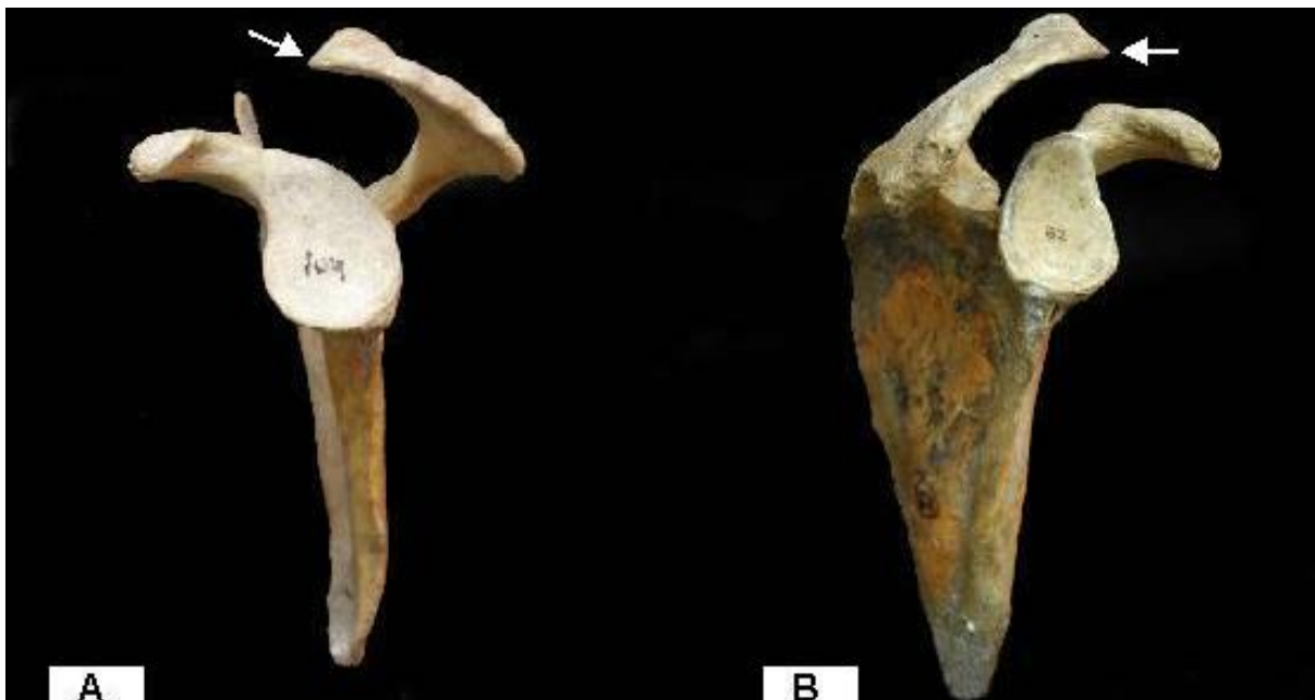
Figure 3: A) Lateral view of right scapula exhibiting type II acromion and enthesophyte at the anterior margin of acromion (arrow). B) Lateral view of right scapula exhibiting type III acromion and enthesophyte at the anterior margin of acromion (arrow).