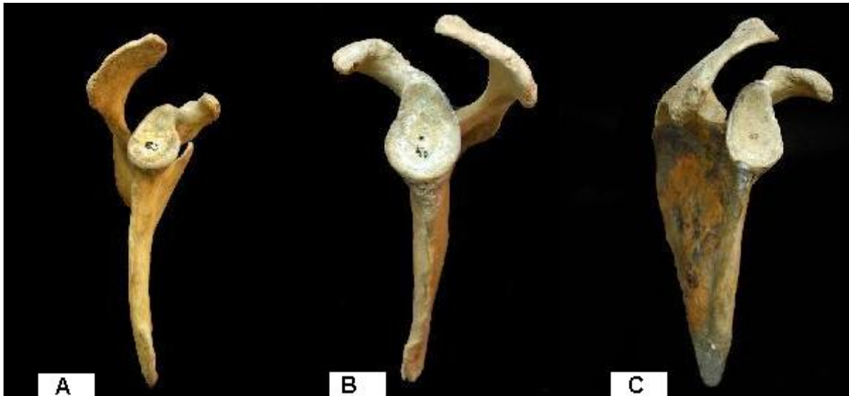
Figure 2: A) Lateral view of right scapula demonstrating type I (flat) acromion. B) Lateral view of left scapula demonstrating type II (curved) acromion. C) Lateral view of right scapula displaying type III (hooked) acromion.

Chi square analysis revealed significant association between type III acromion and presence of enthesophytes ( p < 0.005 ).