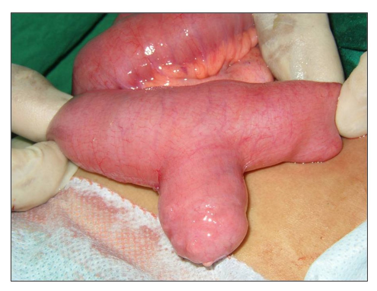
Figure 1. Meckel's Diverticulum shown during surgery.

must be considered in any patient with unexplained abdominal complaints of nausea and vomiting intestinal bleeding. Various or investigations laparotomy, are biopsy, ultrasonography (USG) of abdomen, superior mesentric angiography to diagnose a bleeding Meckel's diverticulum (Rossi et al, 1996) and techtinium scan to detect a heterotopic rest within diverticulum (Williams, 1981). postoperative mortality following diverticulectomy ranges from 2-15% (Mendelson et al, 2001).