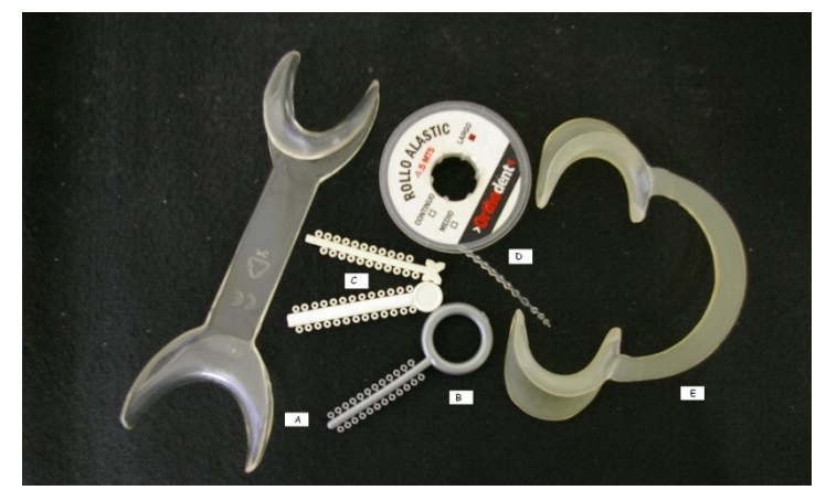
Figure 1: Acrylic and elastomeric orthodontic instruments monitored.A and E: acrylic intraoral cheek retractors; B and C: ligature sticks; D: spools of elastomeric chains