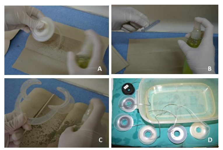
Figure 2: Disinfection process. A, B and C: Spraying with aqueous solutions of 2.5% glutaraldehyde; D: immersion of the end of the chain in aqueous solutions of 2.5% glutaraldehydethe